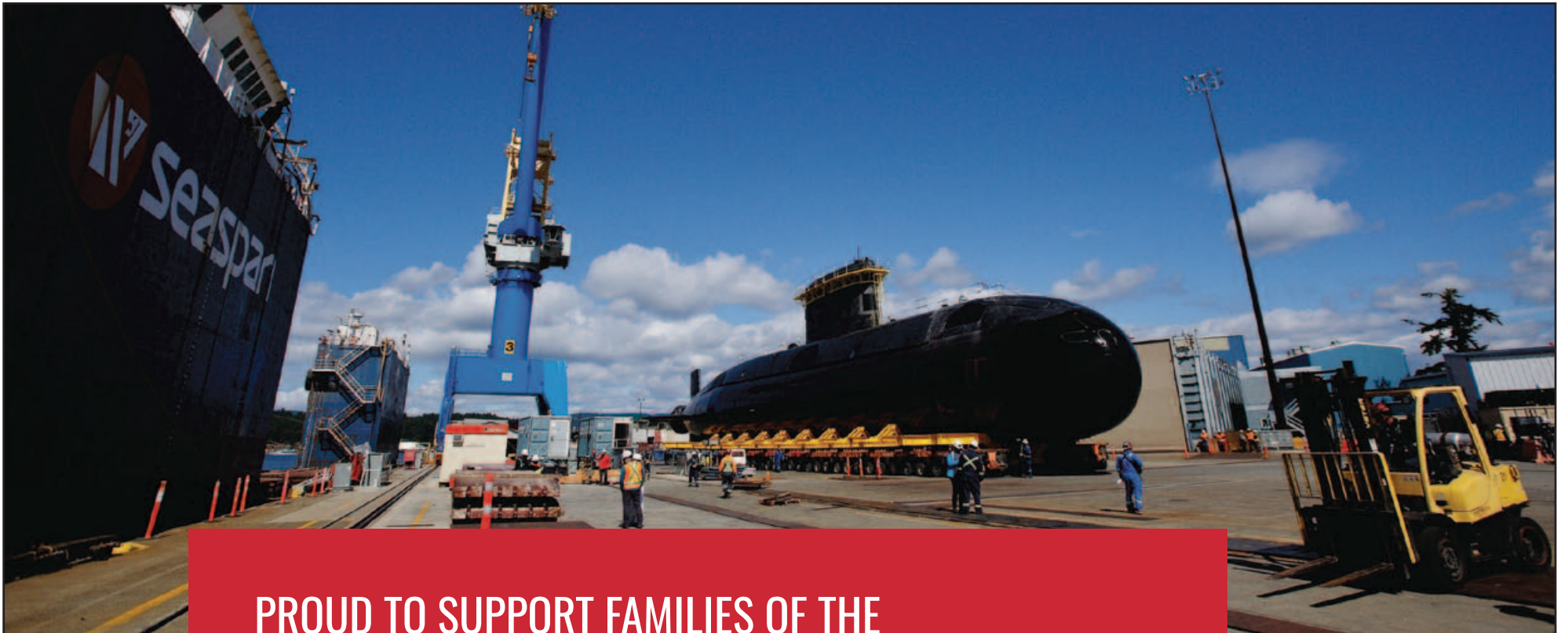
Photo taken at the Government of Canada owned facility named the Esquimalt Graving Dock