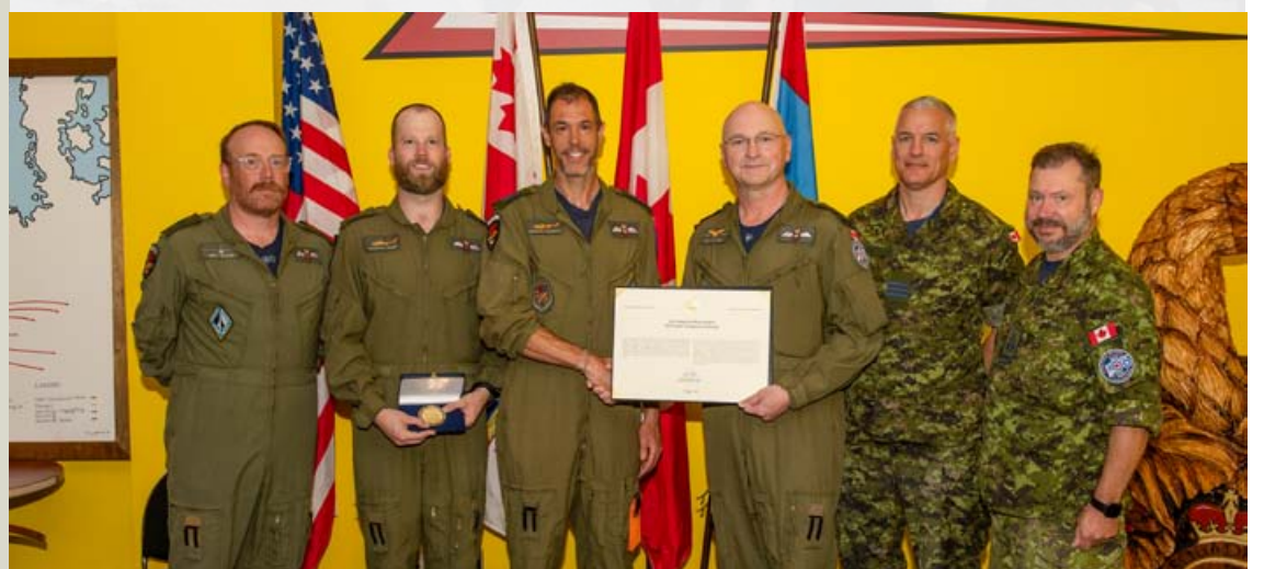
442 Transport and Rescue Squadron receive the Canadian Forces' Unit Commendation on July 25. Photos supplied