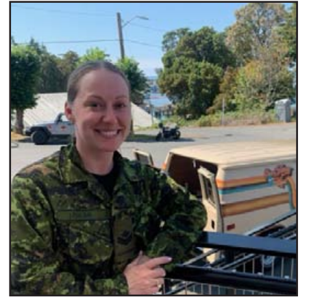
Junior Ranks members of the Pacific Fleet Club celebrate the official reopening on Aug. 15 at CFB Esquimalt. Photos supplied