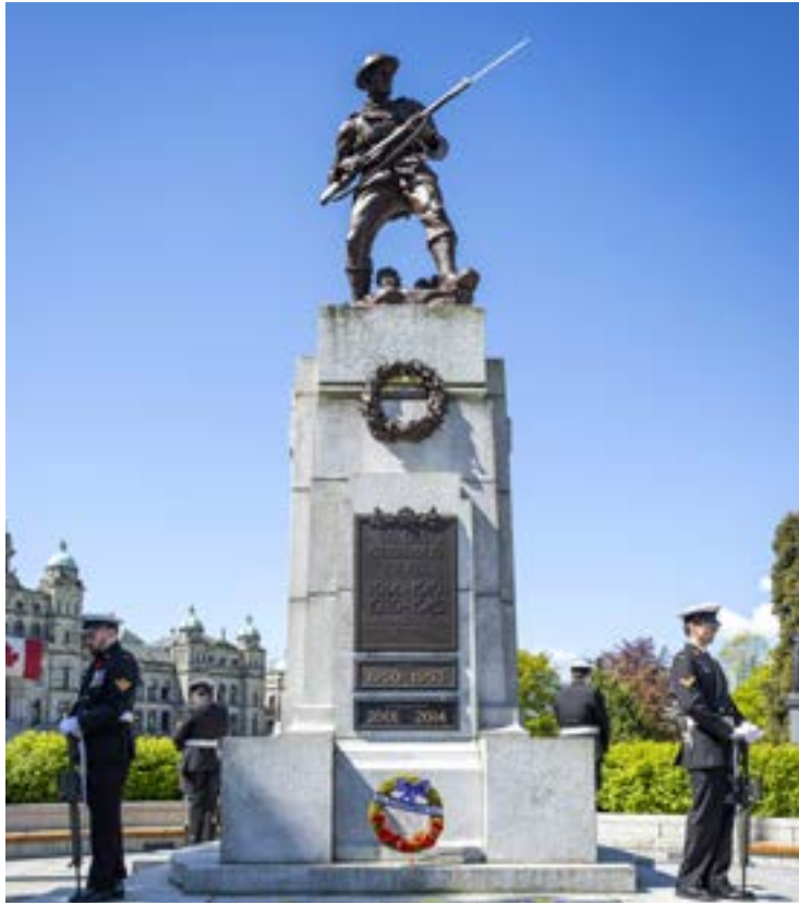
Active members of the Royal Canadian Navy stand in remembrance on May 4 around War Memorial to the Unknown Soldier, the British Columbia Legislature Cenotaph at the Legislative Assembly of British Columbia.