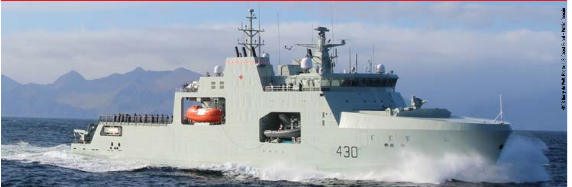
HMCS Harry de Wolf.

Members of the Royal Canadian Navy (RCN) and United States Coast Guard Law Enforcement Detachment (LEDET) pose with 750kg of seized narcotics on HMCS Harry DeWolf after a successful illegal narcotics interdiction. Read more on Page 5.