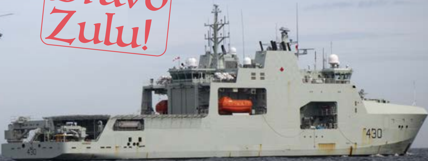
HMCS Harry DeWolf.