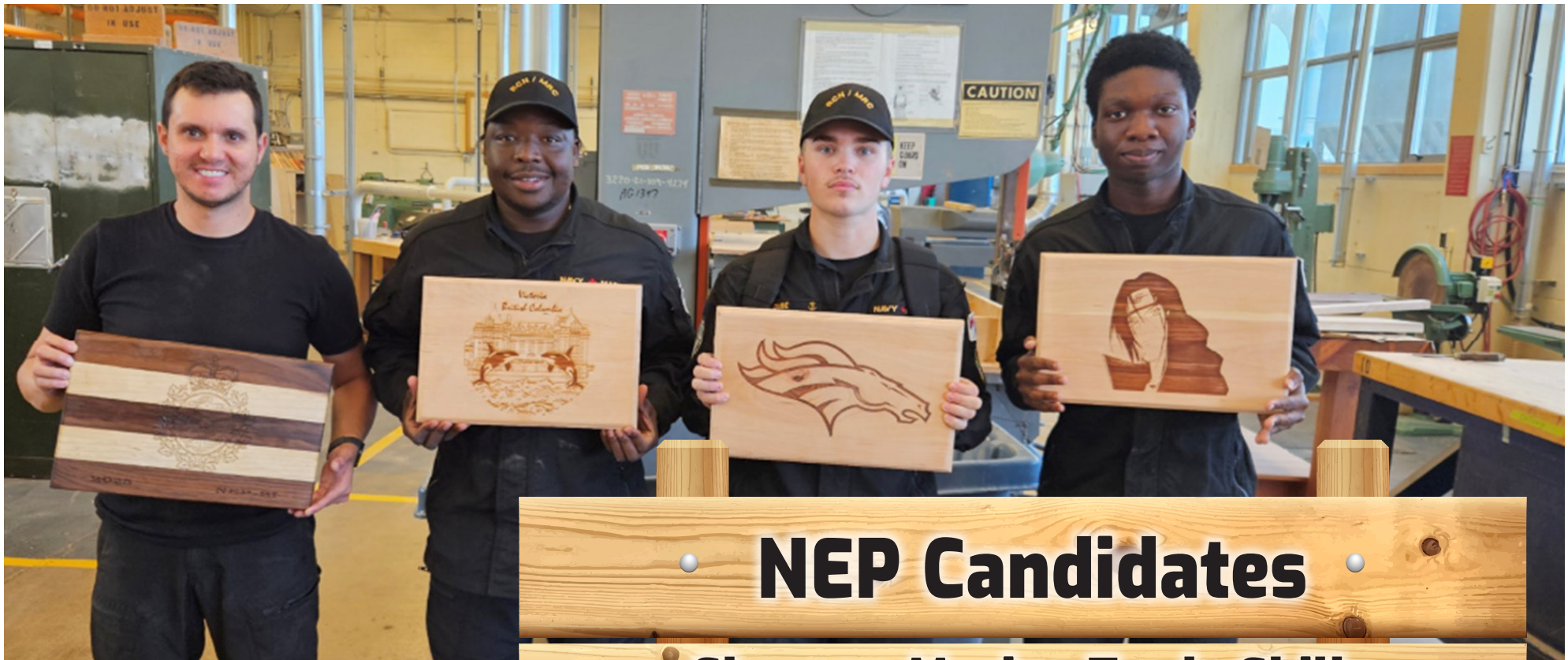
Four NEP candidates from the Naval Fleet School Pacific's Marine Systems Engineers (MSE) Division pose for a photo with their completed cutting boards on July 31.