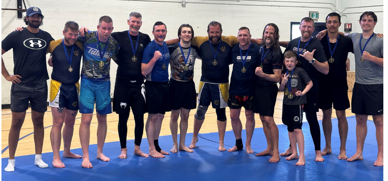
Members of the Tritons Grappling Team pose for a photo with their medals following the Rollathon charity event.