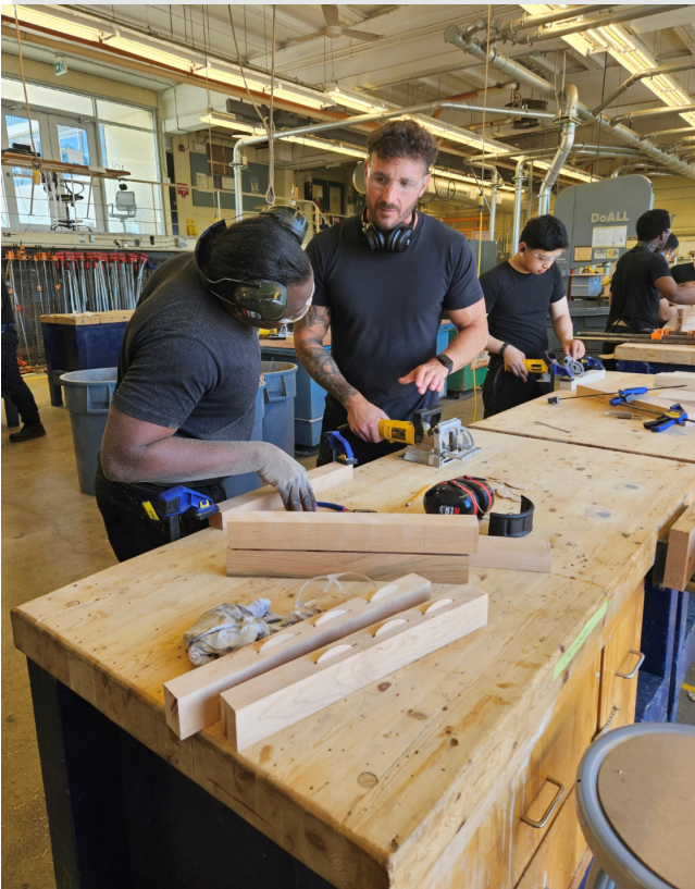
An NEP candidate from the Naval Fleet School Pacific's Marine Systems Engineers (MSE) Division receives instruction on proper woodworking technique and tool setup.