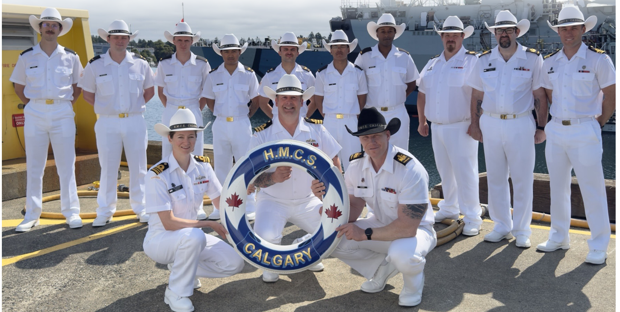
Top inset: A Royal Canadian Navy sailor builds connections with a young civilian dressed in an Esquimalt Fire uniform. Members of HMCS Calgary pose at Ogden Point, Victoria on 15 May 2025.

Following the weekend, HMCS Vancouver continued their support of Calgary's anniversary with a day sail for guests. Importantly, the exemplary support from the Vancouver and its crew highlighted the strong community of the West Coast Fleet and the RCN. Heartfelt thanks to all those that participated or supported the successful celebratory weekend of Calgary's 30th anniversary. Onward!