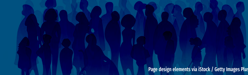
Page design elements via iStock / Getty Images Plus.