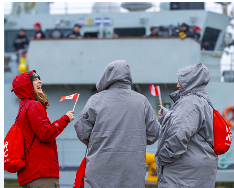
HMCS Summerside departs for Op CARIBBE for a nine weeks.

National Indigenous Peoples Day (NIPD), observed annually on June 21, recognizes and celebrates the cultures, histories, languages, and contributions of First Nations, Inuit, and Métis Peoples across Canada. While this year's official celebrations have concluded, the opportunity to learn, listen, and engage does not end with a single day. As Canadians gather to mark Canada Day, consider taking time to explore Indigenous stories, perspectives, art, culture, food, and history as part of an ongoing commitment to understanding the full story of Canada.