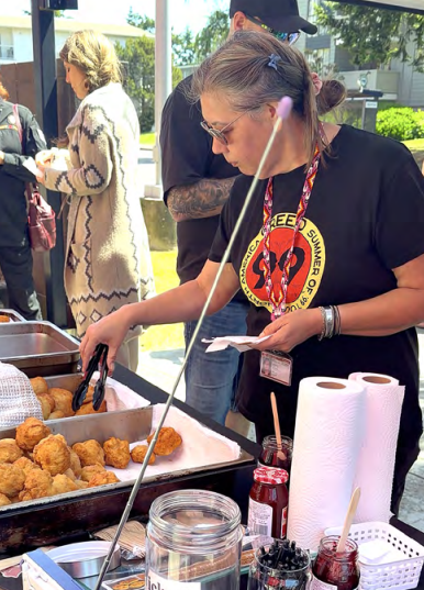
Dans le cadre de la Semaine de sensibilisation aux cultures autochtones, le personnel s'est réuni pour partager un repas et célébrer l'esprit communautaire lors du concours annuel de bannock organisé par le Groupe consultatif autochtone de la Défense. Cet événement soutient les efforts continus en faveur de la réconciliation, en favorisant le respect, en renforçant les relations et en approfondissant la compréhension des cultures, de l'histoire et des contributions autochtones.