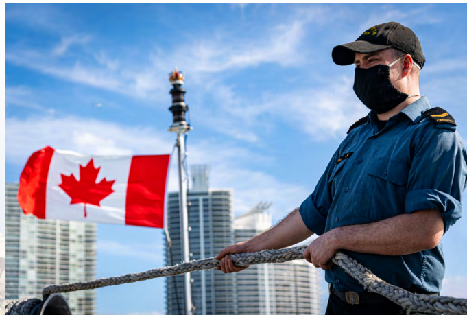
HMCS Moncton exits Miami, Florida on their way to the Caribbean Sea during Op CARIBBE in Jan 2021.