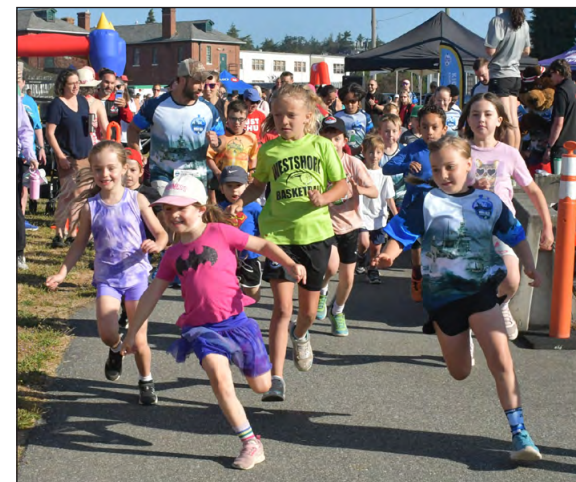
Moments from the 2026 CFB Esquimalt Navy Run.