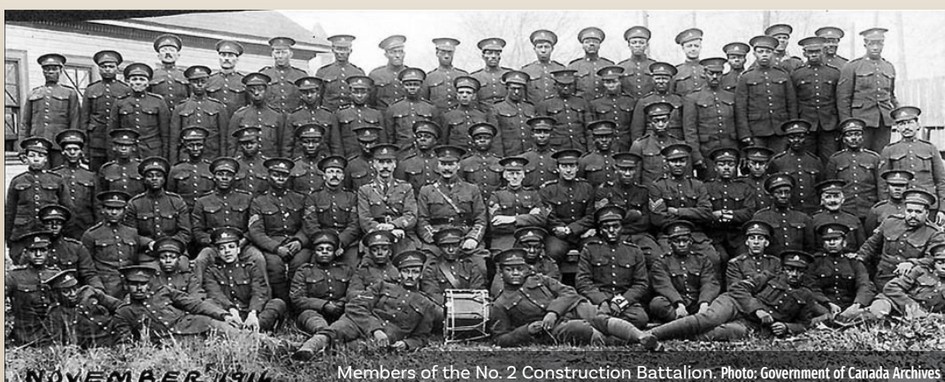
Members of the No. 2 Construction Battalion.