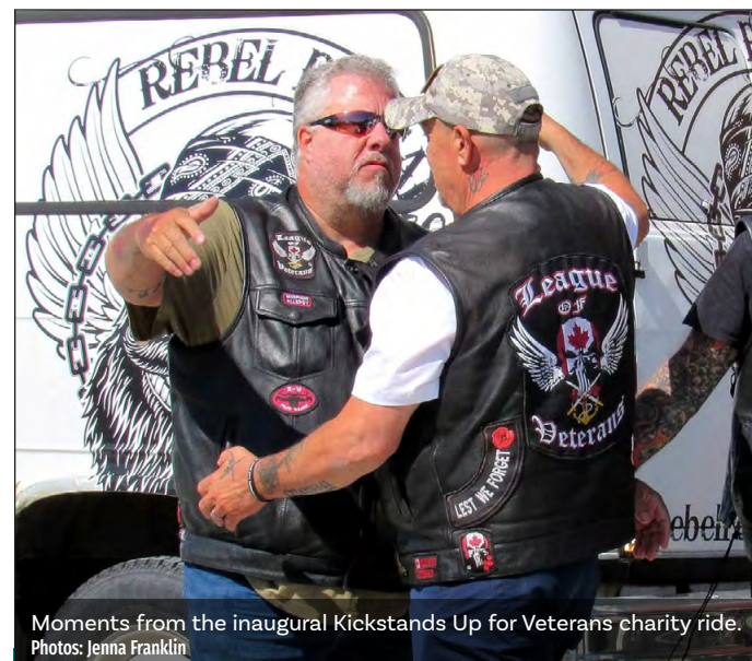
Moments from the inaugural Kickstands Up for Veterans charity ride.