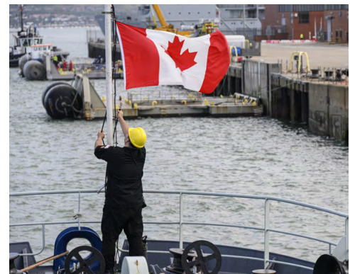
A member from the ships company aboard HMCS Summerside (MM 711) brings in the bumpers as the ship slips from the Jetty at Portsmouth, United Kingdom in July 2023.