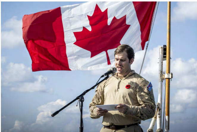
HMCS Charlottetown, Flagship of Standing NATO Maritime Group Two (SNMG2), conducts a Remembrance Day ceremony in the Mediterranean Sea while the ship is deployed on Op REASSURANCE in Nov 2024.