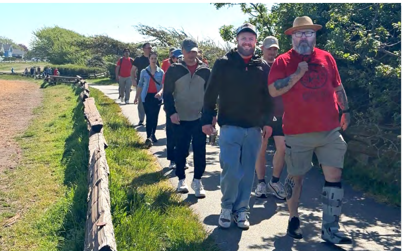
Participants gather at Clover Point Park on May 5, 2026, for the Movement is Medicine Walk/Run/Wheel event in recognition of Red Dress Day, raising awareness of Missing and Murdered Indigenous Women, Girls, and 2SLGBTQIA+ people (MMIWG2S+) and honouring those impacted by this ongoing national crisis.

By engaging with DAG content through multiple channels and encouraging others to do the same, we create a culture of continuous learning and shared responsibility – one where awareness turns into action, and knowledge drives inclusion.